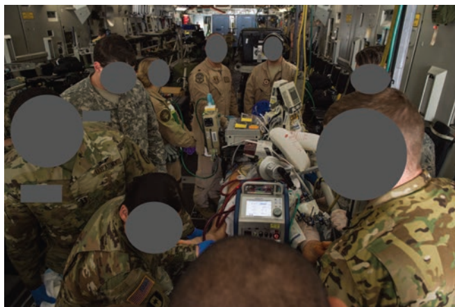
Figure 4. Recent ECMO transport from Baghdad to SAMMC.

A longstanding research program in respiratory rescue technologies for severely burned patients at the US Army Institute of Surgical Research was expanded to include protocols